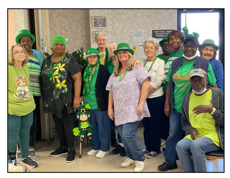
Berrien Senior Center