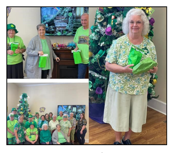
Bacon County Senior Center