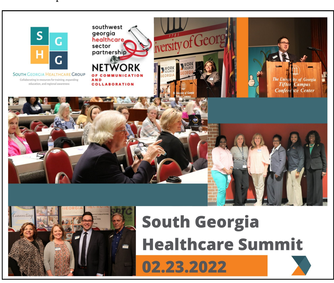
Moments from the South Georgia Healthcare Summit

WorkSource Southwest Georgia as the two regions work to build the Healthcare sector pathway for South Georgia. With 175 registrants, the four-hour event was a tremendous success. Local employers shared their successes and challenges conworkforce. cerning Attendees had the opportunity to offer insights on a multitude of topics in small round table discussions. The event con-