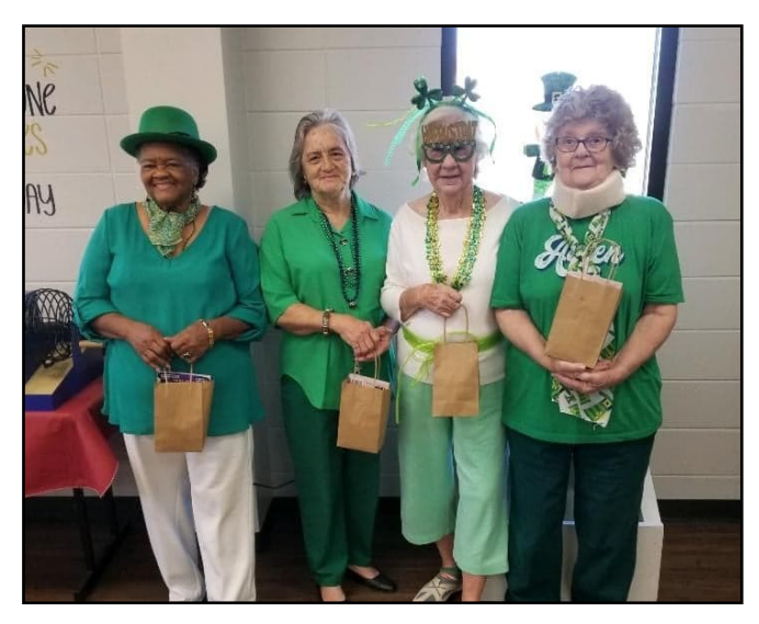
Lanier Senior Center