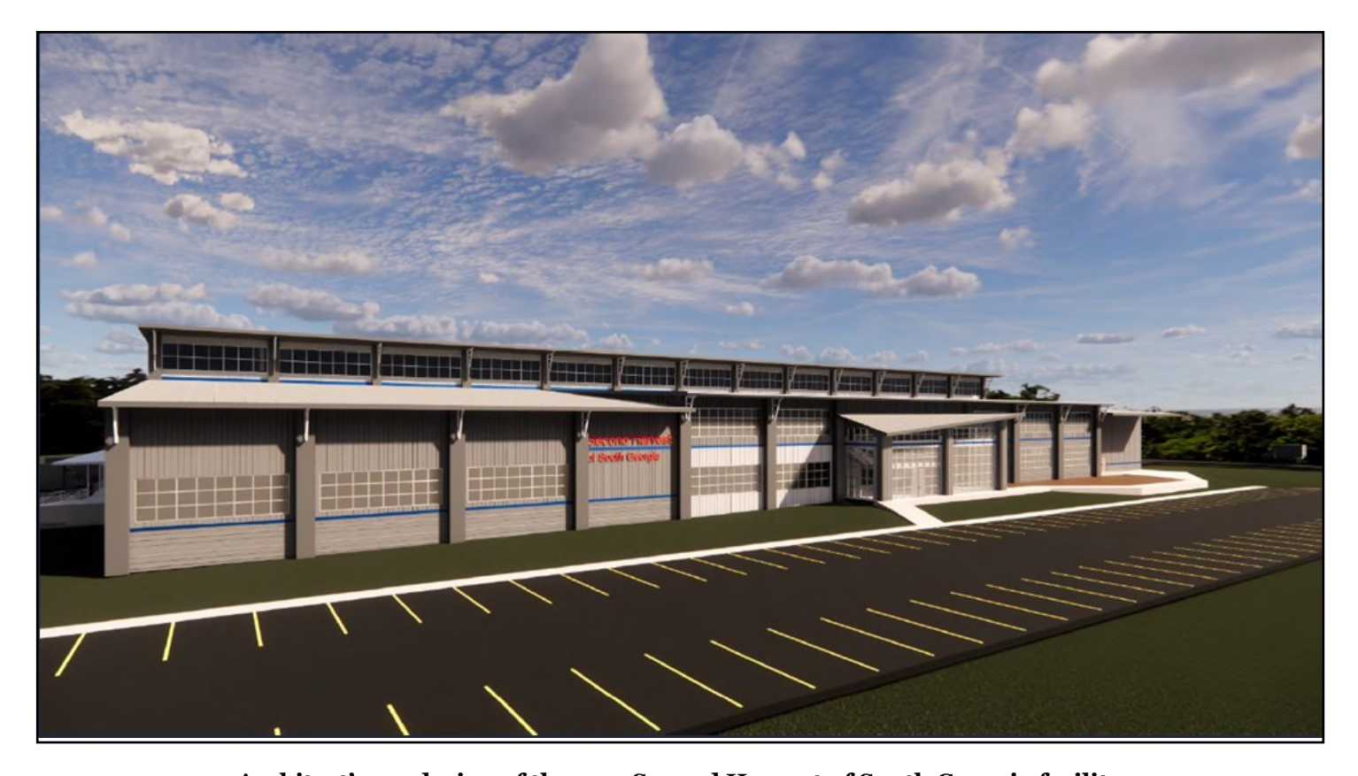
Architect's rendering of the new Second Harvest of South Georgia facility

Lowndes County Awarded $18 Million in CDGB-CV Funding for New Second Harvest Food Bank (continued)