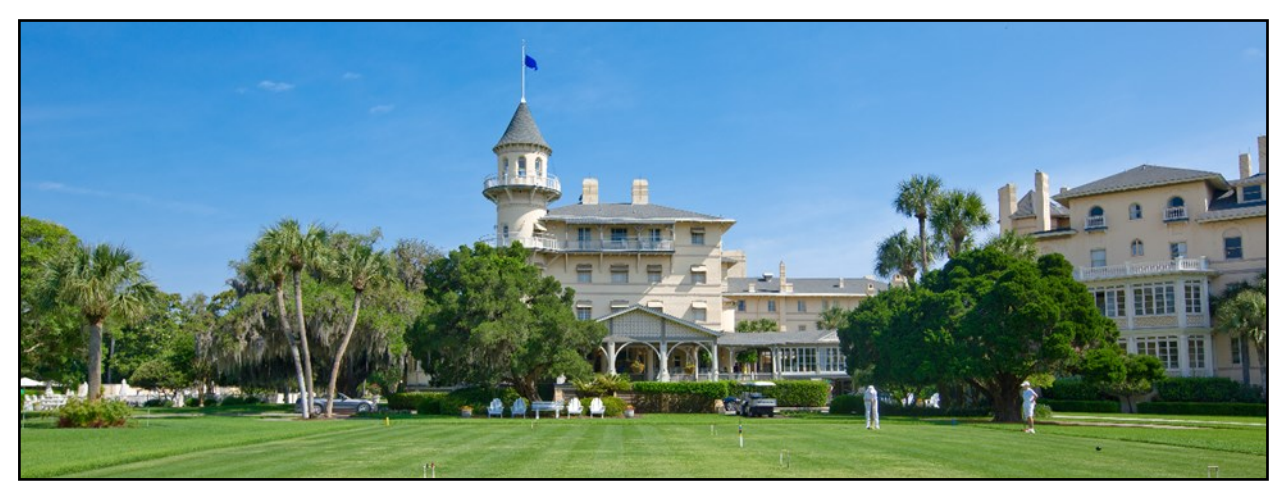
Jekyll Island Inn and Clubhouse

The Department of Community Affairs (DCA) will be hosting a training for planning commissioners, local government staff, and elected officials on May 12-13, 2022 on Jekyll Island. This is a two-day training course which will provide information on land use planning, growth, and development.