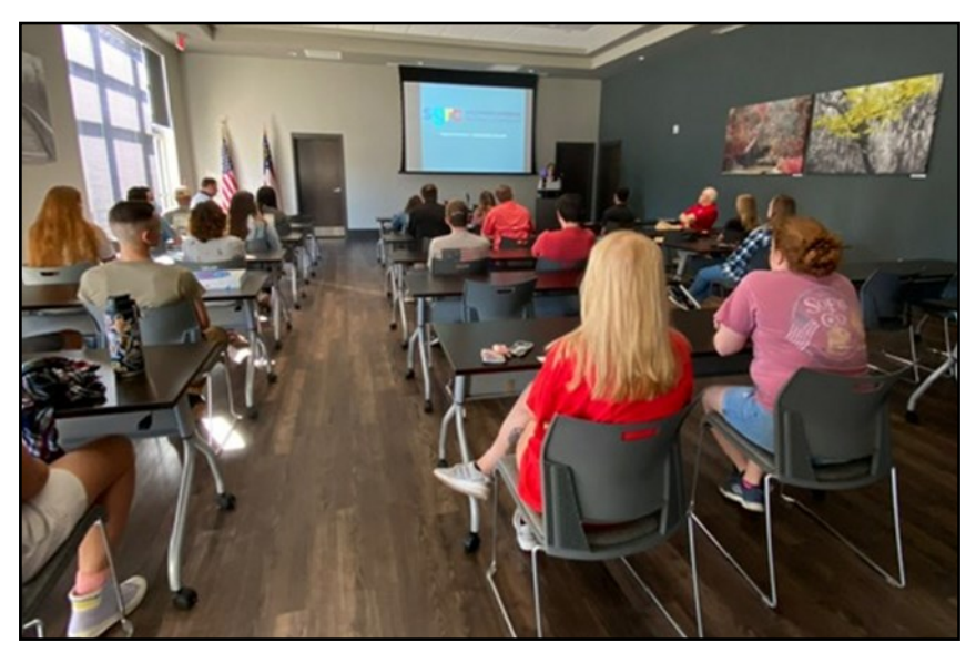
VSU Students visit SGRC to initiate Bikeability Project March 2022

bikeability conditions and develop an index of potential improvements for all city and county-owned roads within the SGRC 18-county region. SGRC and VSU will work closely together throughout the project, which is expected to last two years. Students from Valdosta State University will be in the field to collect the data and develop the potential improvements list. The Transportation Department staff of SGRC will monitor the project progress and review data and proposals.