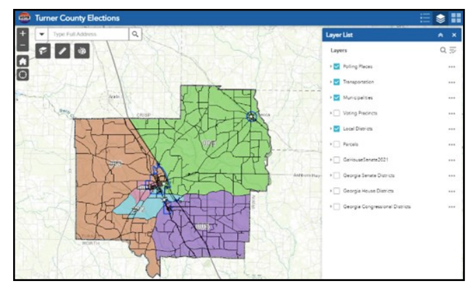
Turner County Elections