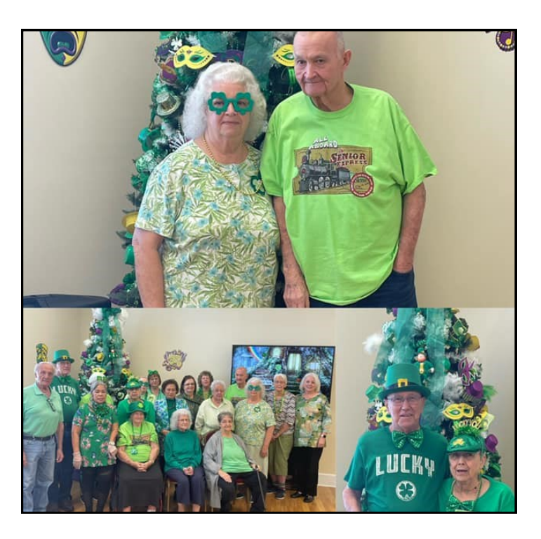
Bacon County Senior Center